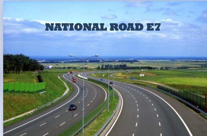
NATIONAL ROAD E7