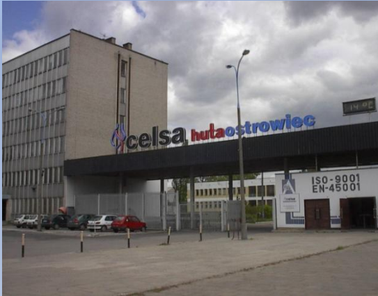
CELSA STEELWORKS OSTROWIEC