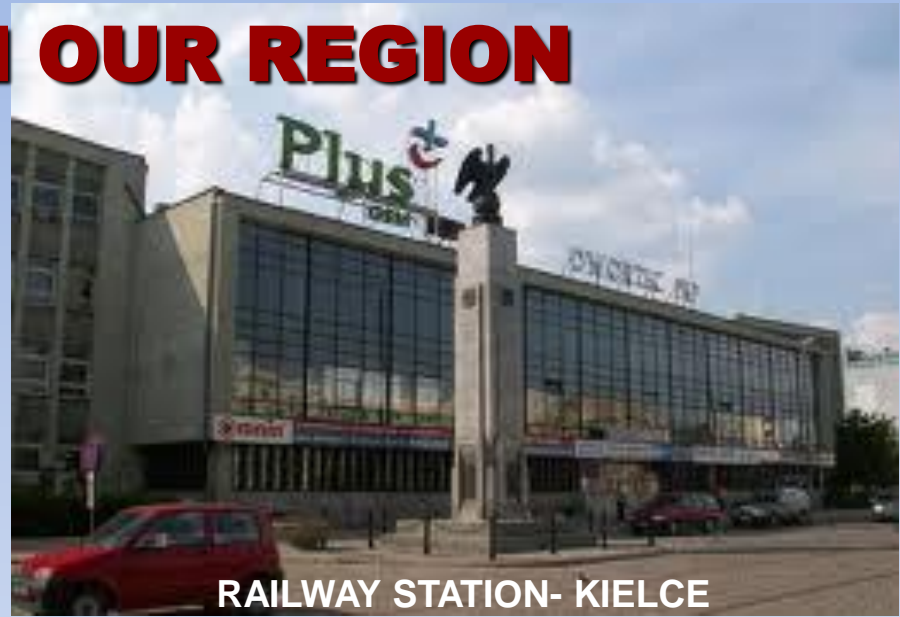
RAILWAY STATION- KIELCE