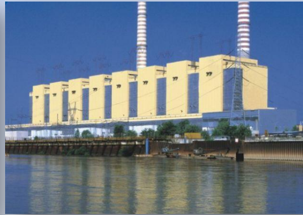
POWER STATION IN POŁANIEC