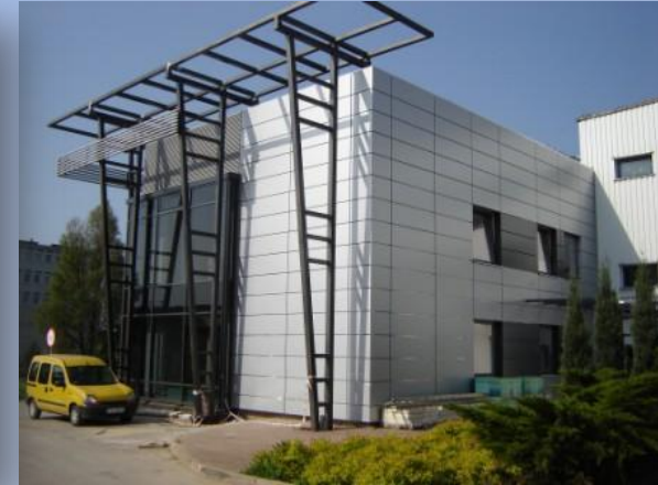
EXBUD SKANSKA S.A. KIELCE