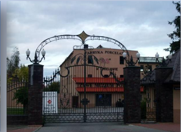
ĆMIELÓW PORCELAIN MANUFACTORY