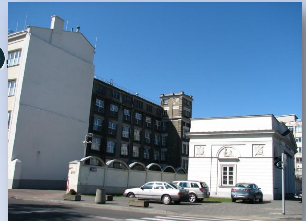
CHOCOLATE MANUFACTORY „WEDEL” IN WARSZAWA