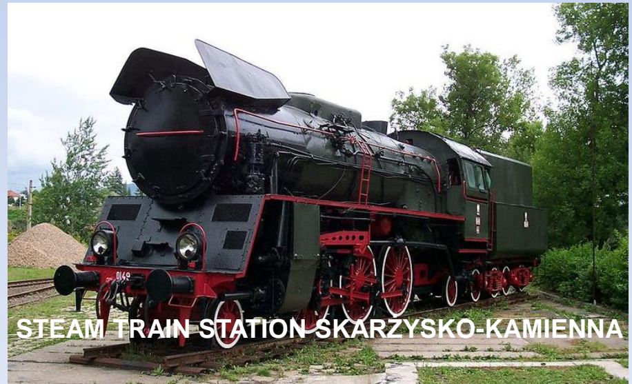
STEAM TRAIN STATION SKARŻYSKO-KAMIENNA