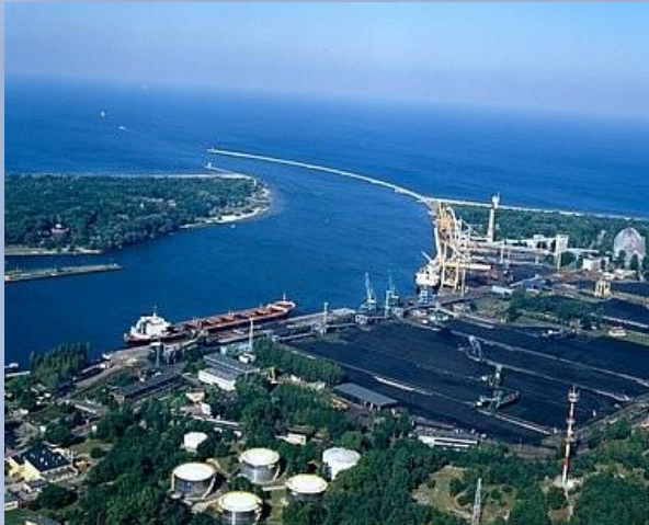
FERRY SERVICE: ŚWINOUJŚCIE -YSTAD