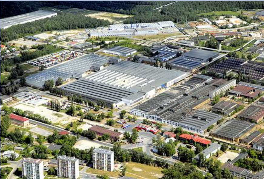
SPECIAL ECONOMIC ZONE S.A. STARACHOWICE