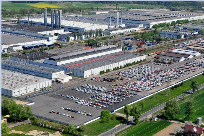
FIAT AUTO POLAND BIELSKO-BIAŁA

There are 22 industrial centers in Poland, placed mainly in the vicinity of big cities.