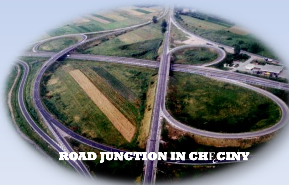
ROAD JUNCTION IN CHECINY