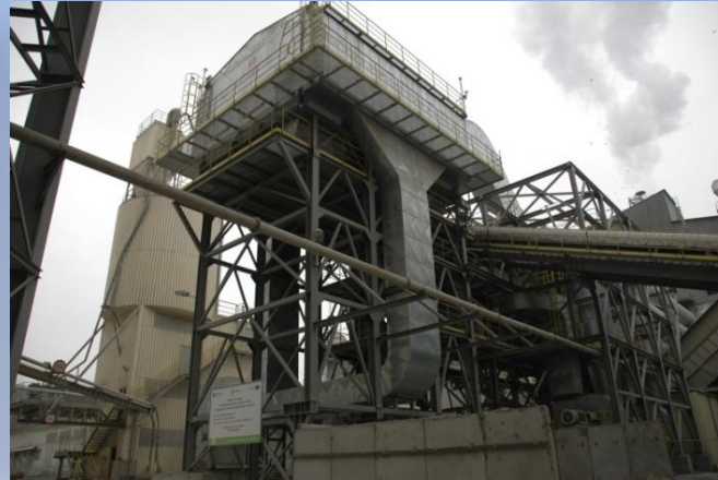
LAFARGE CEMENT PLANT S.A. MAŁOGOSZCZ