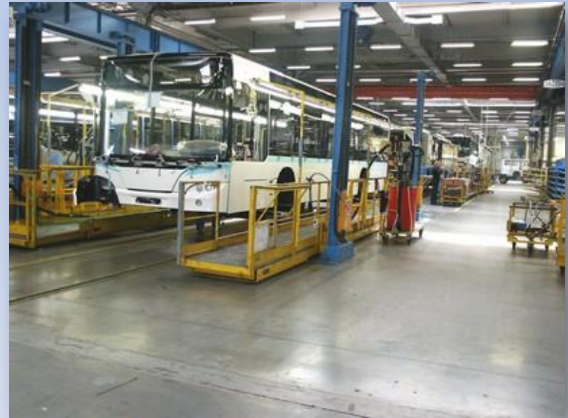
MAN TRUCK & BUS