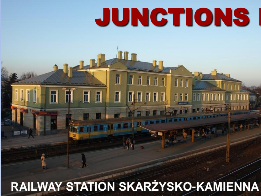
RAILWAY STATION SKARŻYSKO-KAMIENNA