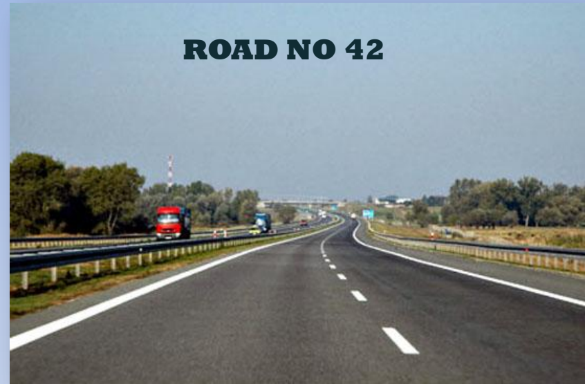
ROAD NO 42

THERE ARE NO MOTORWAYS RUNNING THROUGH THE REGION, ONLY NATIONAL ROADS. ROAD NETWORK IS 12,129 KM LONG. THE LENGTH OF NATIONAL ROADS AMOUNTS TO 752 KM. THE MOST IMPORTANT ARE: NO7 – FROM NORTH TO SOUTH, NO74 – FROM WEST TO EAST