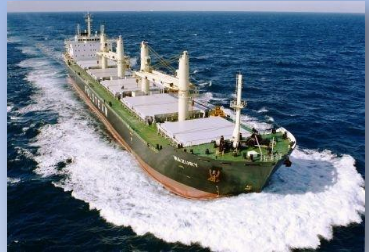
PASSENGER SHIP - THE BALTIC SEA

ACCESS TO THE SEA AND MANY WATER RESERVOIRS MAKES IT POSSIBLE TO DEVELOP NAVIGATION AND SHIPPING.