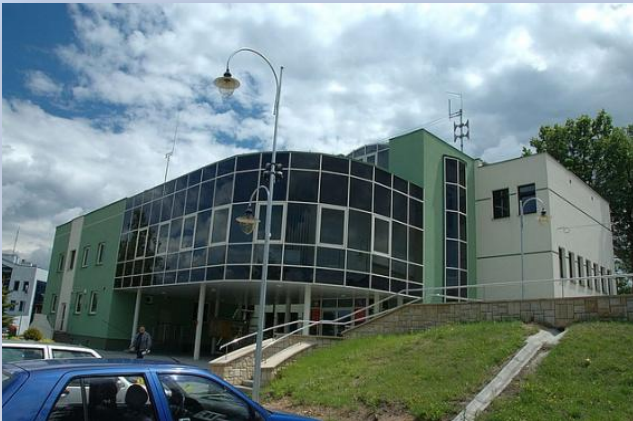
BUILDING MATERIALS STORE S.A. BUSKO-ZDRÓJ